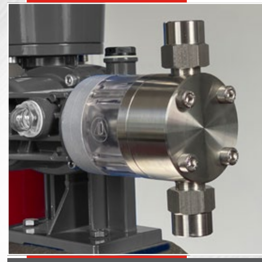
Heavy Duty Pump Head Design