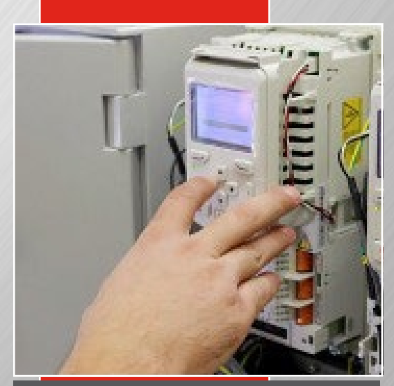
Variable Speed Drive Compatible