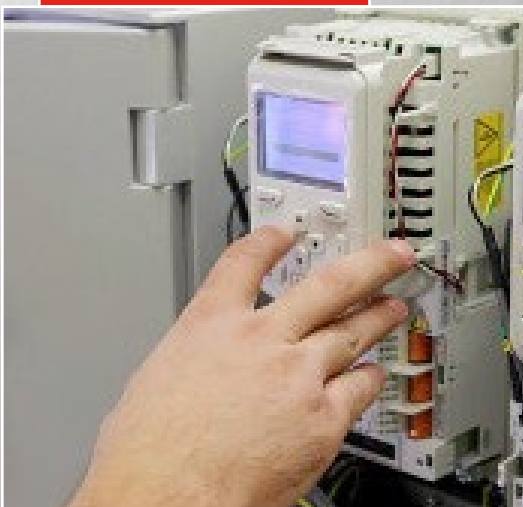
Variable Speed Drive Compatible