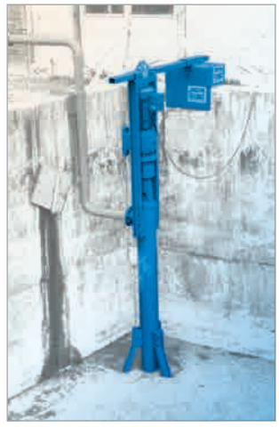
KL-T in operation with mounting bracket and three-point set up